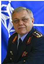
Gen. (Ret) Harald Kujat Chairman, NCOIC Advisory Council Germany