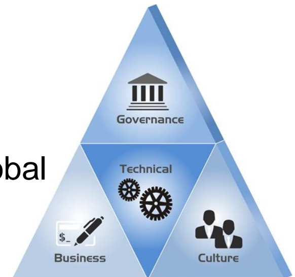
NCOIC QuadTrangle™ Cross-Domain Interoperability